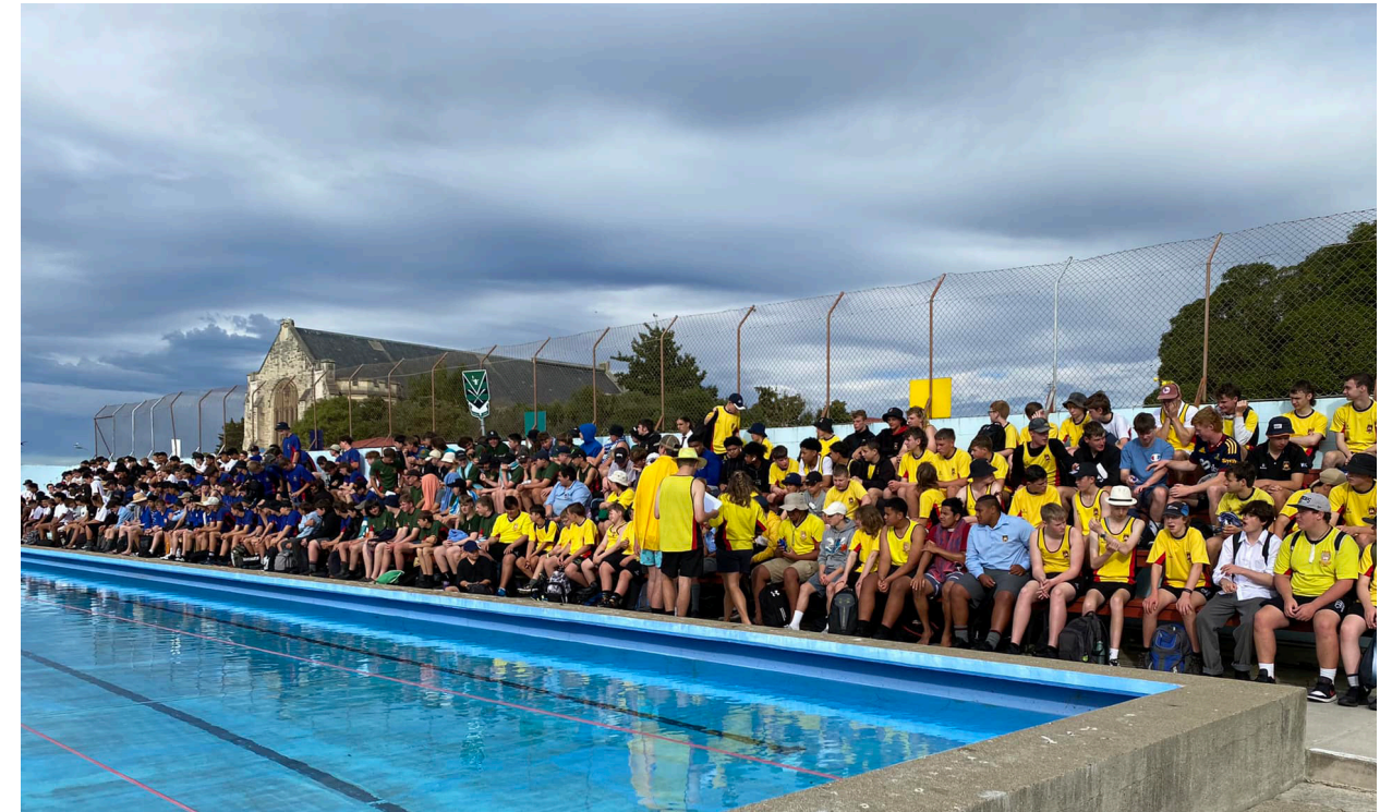
The extensive grounds provide outstanding recreational and sporting facilities onsite.

The 97 year old Hall of Memories is a Category 1 NZ Historic Places Trust building. With its Oamaru stone exterior, mature timber interior resplendent with pipe organ it is the 'heartbeat' of our school. Jacinda Ardern, NZ's former Prime Minister, on her recent visit to the school specifically mentioned how impressed she was with the Hall of Memories – in her words “the most impressive school building she had ever been to”