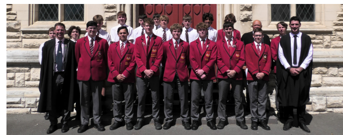
ACHIEVEMENT IN NCEA (PARTICIPATION BASED DATA) - WAITAKI BOYS' HIGH SCHOOL

In 2023 we were pleased to see our pass rates across all levels of NCEA significantly above the national boys average and of those schools with a similar equity index.